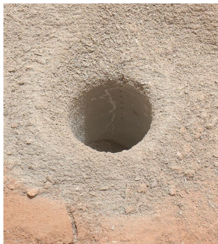
Image taken by the Mars Hand Lens Imager of the John Klein drill hole (1.6 cm in diameter) at Yellowknife Bay reveals gray cuttings of mudstone (ancient lake sediments), rock powder, and interior wall. An array of eight ChemCam laser shot points can be seen. The gray color suggests that reduced, rather than oxidized, chemical compounds and minerals dominated the pore fluid chemistry of the ancient sediment. A cross-cutting network of sulfate-filled fractures indicates later flow of groundwater through fractures after the sediment was lithified.

Ming et al. show that the thermal decomposition of rock powder yielded NO and CO 2 , indicating the presence of nitrogen- and carbon-bearing materials. CO 2 may have been generated by either carbonate or organic materials. Concurrent evolution of O 2 and chlorinated hydrocarbons indicates the presence of oxychlorine species. Higher abundances of chlorinated hydrocarbons in the lake mudstones, as